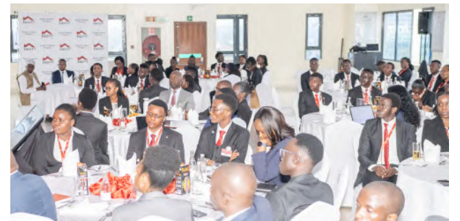
A section of ELP scholars follow proceedings during the commissioning of scholars who will be joining 71 global universities.