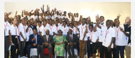
ELP Scholars from DRC.

Nurturing the immense potential of Congolese youth, ELP selects the best students who score over 80% on the state exam, demonstrating a commitment to excellence. ELP trains and supports